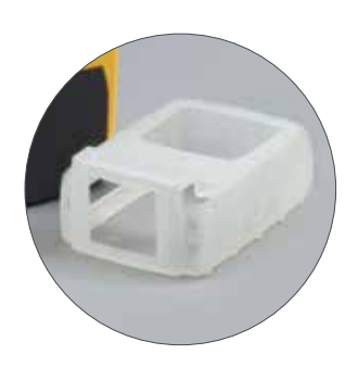
The Nardalert S3 casing is made of robust plastic. A silicone cover is also supplied as additional protection.

The overall concept using interchangeable sensors is innovative. As the device itself needs calibration less often than the sensor, it is sufficient and much cheaper to send off just the sensor for calibration. The calibration data are stored in the sensor and taken into account in the result by the device. This guarantees full precision at all times.